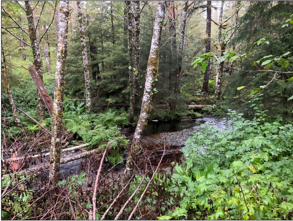
Figure 2.—Channel at waypoint 1425.