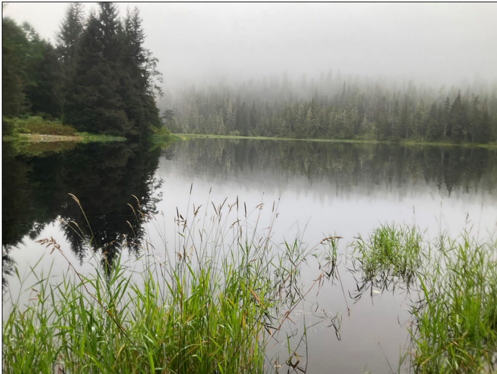
Figure 3.—Lake at waypoint 1440.