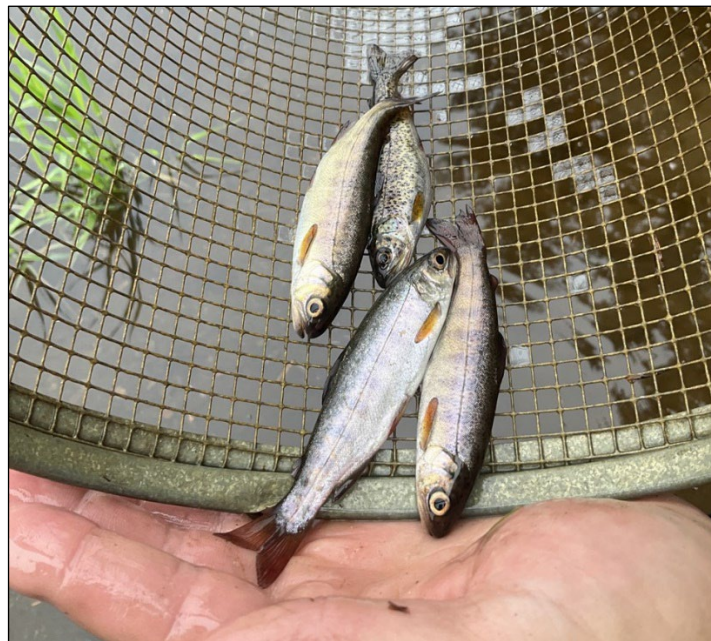
Figure 1.–Juvenile coho salmon and a cutthroat trout captured at waypoint 1440.